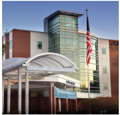
South County Hospital